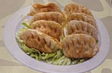
Pan Fried Dumplings