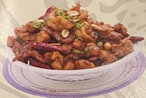
Kung Pao 3 Delight Bowl