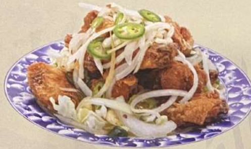
Pepper Salted Chicken Wings

Sauteed Bok Choy w/ Garlic (Garlic) $11.95 (Chicken Only) $12.95 (Beef Only) $13.95 (Shrimp Only) $14.95