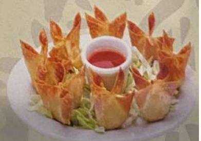
Cream Cheese Wontons