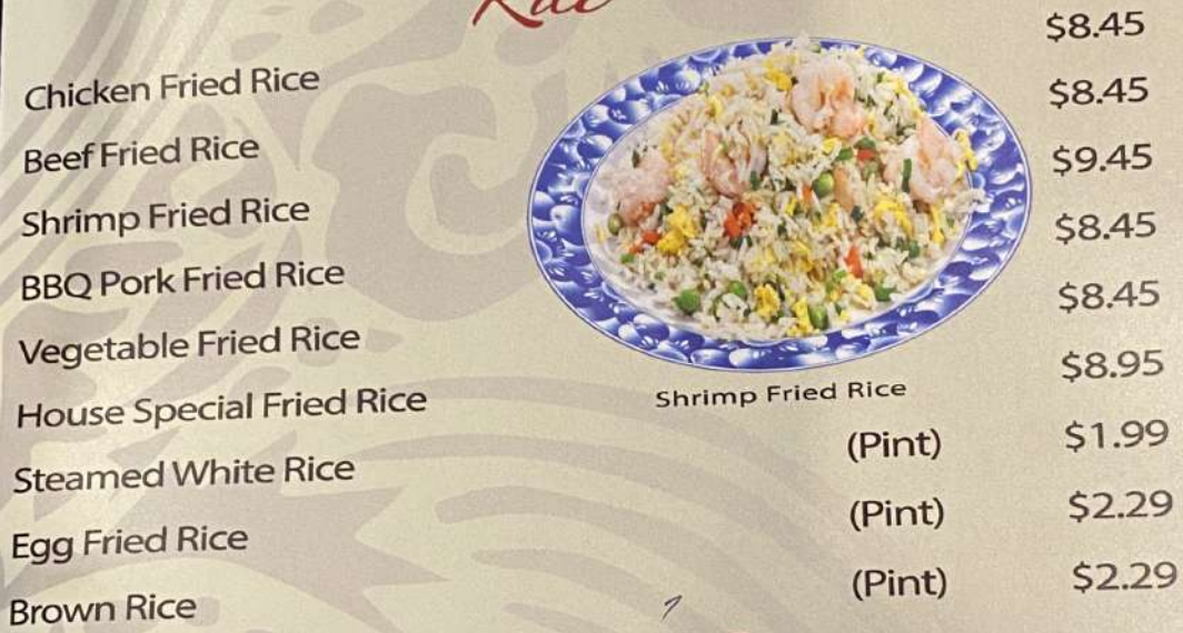
Shrimp Fried Rice