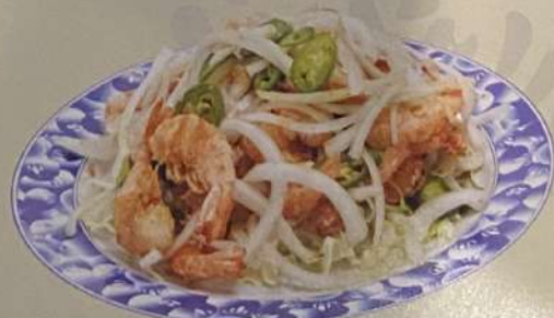
Pepper Salted Shrimp