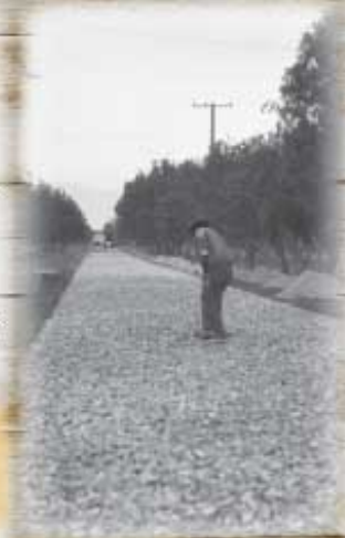
Paving on Hammer Ave.

Our Homemade Biscuits and Homemade Country Gravy served with Hash Browns OR Home Fries 9.89-Half or 10.89-Full