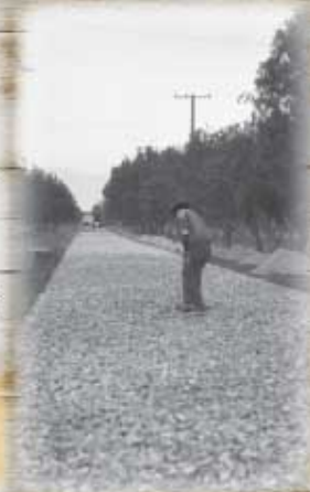
Paving on Hammer Ave.

Our Homemade Biscuits and Homemade Country Gravy served with Hash Browns OR Home Fries 8.89-Half or 9.89-Full